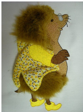
Stitch Design 2 first

Hoop 2 layers of water soluble stabilizer. Stitch the first color. Place a piece of printed cotton fabric over the larger stitched area. Stitch the next color. Trim fabric. Stitch the next color. Trim fabric. Cut designs out of stabilizer. Gather the top of piece.