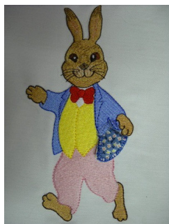
Stitch Design 2 first

Hoop 2 layers of water soluble stabilizer. Stitch the first color. Place a piece of printed cotton fabric over the larger stitched area. Stitch the next color. Trim fabric. Stitch the next color. Trim fabric. Cut designs out of stabilizer. Gather the top of piece.