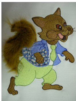
Stitch Design 2 first

Hoop 2 layers of water soluble stabilizer. Stitch the first color. Place a piece of printed cotton fabric over the larger stitched area. Stitch the next color. Trim fabric. Stitch the next color. Trim fabric. Cut designs out of stabilizer. Gather the top of piece.