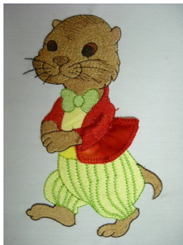
Stitch Design 2 first

Hoop 2 layers of water soluble stabilizer. Stitch the first color. Place a piece of printed cotton fabric over the larger stitched area. Stitch the next color. Trim fabric. Stitch the next color. Trim fabric. Cut designs out of stabilizer. Gather the top of piece.